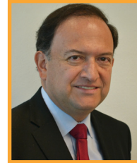
Pedro Pacheco Villagrán CONAC President 2013