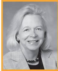
Mary Downs Academy Executive Director