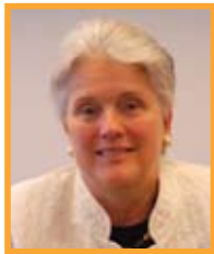
Grace Hinchman Academy